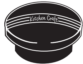
Knob Part #: P122-19 DISCONTINUED REPLACE WITH: P116-19K