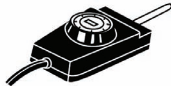
Thermo-Plug Part #: 7501-78 DISCONTINUED 110V REPLACE WITH: KA30PC005KC-BP