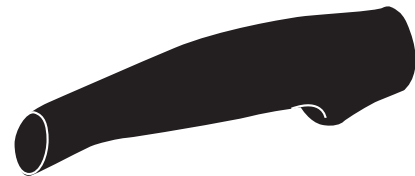
Handle Part #: P621-20 DISCONTINUED REPLACE WITH: P1074-20K